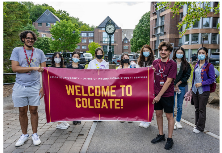
Class of 2026 International Student Arrival Day

During ISO, you will learn all about your F-1 visa status and what you need to do to maintain legal status. Refer to the guides provided with your Form I-20 for instructions on how to apply for your visa and what to expect at a port of entry. (Canadian citizens should refer to the guide on acquiring F-1 status at a U.S. port of entry.) The guides can also be downloaded from the OISS website at colgate.edu/oiss . Refer to the OISS website for detailed information about F-1 visa status, employment authorization, and maintaining valid F-1 status. Another great resource is studyinthestates.dhs.gov/students .