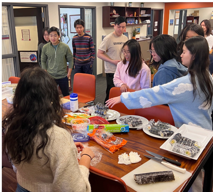
Students share cultural meals in the center for international programs.