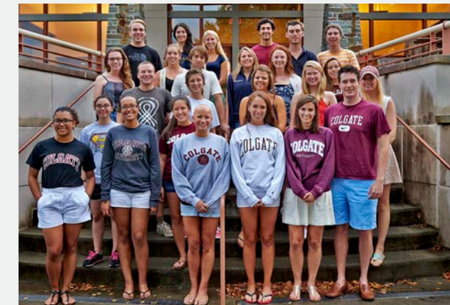
Annual giving student callers.