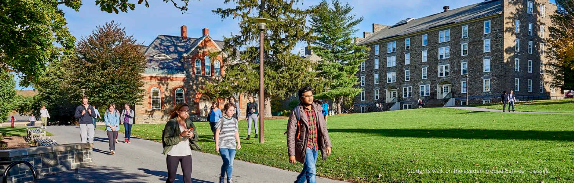
Students walk on the academic quad between classes.