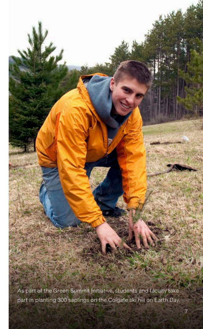
As part of the Green Summit Initiative, students and faculty take part in planting 300 saplings on the Colgate ski hill on Earth Day.

Colgate is regularly named in national media as one of America's most beautiful college campuses. The Colgate Fund helps the building and grounds team to maintain campus, keeping the University's built and natural environs beautiful for new generations of students as well as alumni who return to the hill for reunions.