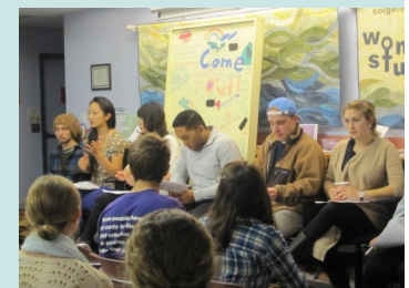
Members of the cast reflect on the play's rehearsals, content, and results.