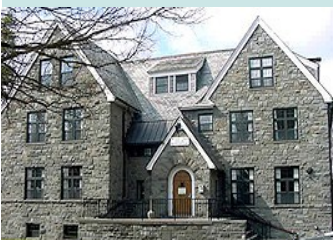
Colgate's Positive Sexuality House serves as a catalyst for positive sexuality initiatives on campus.

The positive sexuality movement at Colgate has burst out of its shell this semester! Colgate Advocates for Positive Sexuality (CAPS), the umbrella club for all things positive sexuality on campus, has taken over social media with a new Facebook group, Twitter feed, and YouTube channel. The new Facebook group received over 100 likes in the first week it was created, and the YouTube channel had reached over 1,000 views in the same amount of time. The Yes Means Yes seminar continued its legendary performance and almost broke its own registration record, filling up in just under two hours this semester. The Positive Sexuality House has also been picking up steam with a whole new crew of housemates and several events in the works, including fishbowl conversations, a new sex toy ordering process, and regular open hours every Friday night.