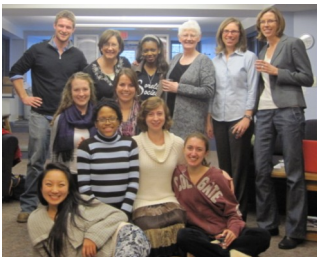
Celebrating the news of being granted "Women and Globalization" faculty member!