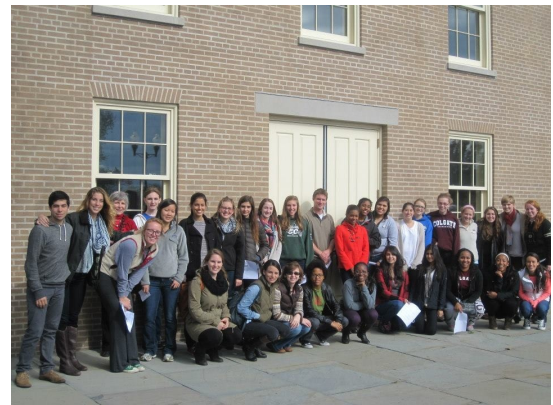
The Colgate crew poses in front of Wesleyan Chapel, where Elizabeth Cady Stanton delivered and signed the Declaration of Sentiments.

What I took away from the trip is that, at the end of the day, the women who initiated these movements were just living in Central New York. It reminded me that the struggle for women's rights comes not only from the idealists and the culture makers, but also from those women living ordinary lives. While the Seneca Falls women's movement was beset with classism and racism, there's a stronger history of coalition building across difference for change. The women's movement grew almost directly out of the abolition movement. The activists of the 19th century recognized that all our oppressions are connected, and that it's up to us, wherever we are, to upset the culture ourselves and create our own change.