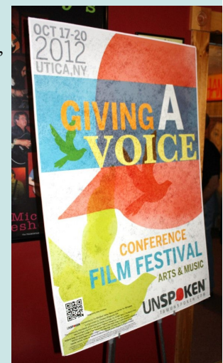
2012 Unspoken Conference at Utica's Radisson Hotel

UNSPOKEN conveyed how social change works and ways to implement ideas effectively. In debriefing, we agreed that Tostan's model of not only listening to and learning from community members, but also allowing for social movements to come from within, was feminist and important to uphold. Too often, Western societies attempt to prod social change in the Global South and are unsuccessful at incorporating the history and desires of community members into programs.