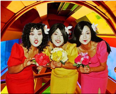
The Mail Order Brides in "Always a Bridesmaid, Never a Bride," one of the performances Velasco analyzed.

By: LGBT 220: Exploration in LGBTQ Studies