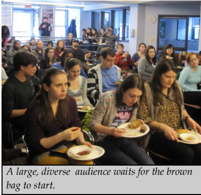
A large, diverse audience waits for the brown bag to start.