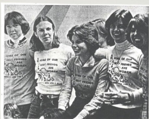
A photograph from our Facebook timeline.

All in all, we remain a healthy, strong, and vibrant Women's Studies Program in another year when we are battling the war on women and the war on women's studies. Thank you for your tireless support and we'll see you in August!