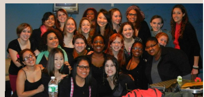
The amazing cast became very close this year.