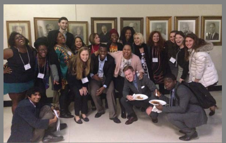
Most of the 2016 National MAU Colgate Group.... We are a very serious group!!