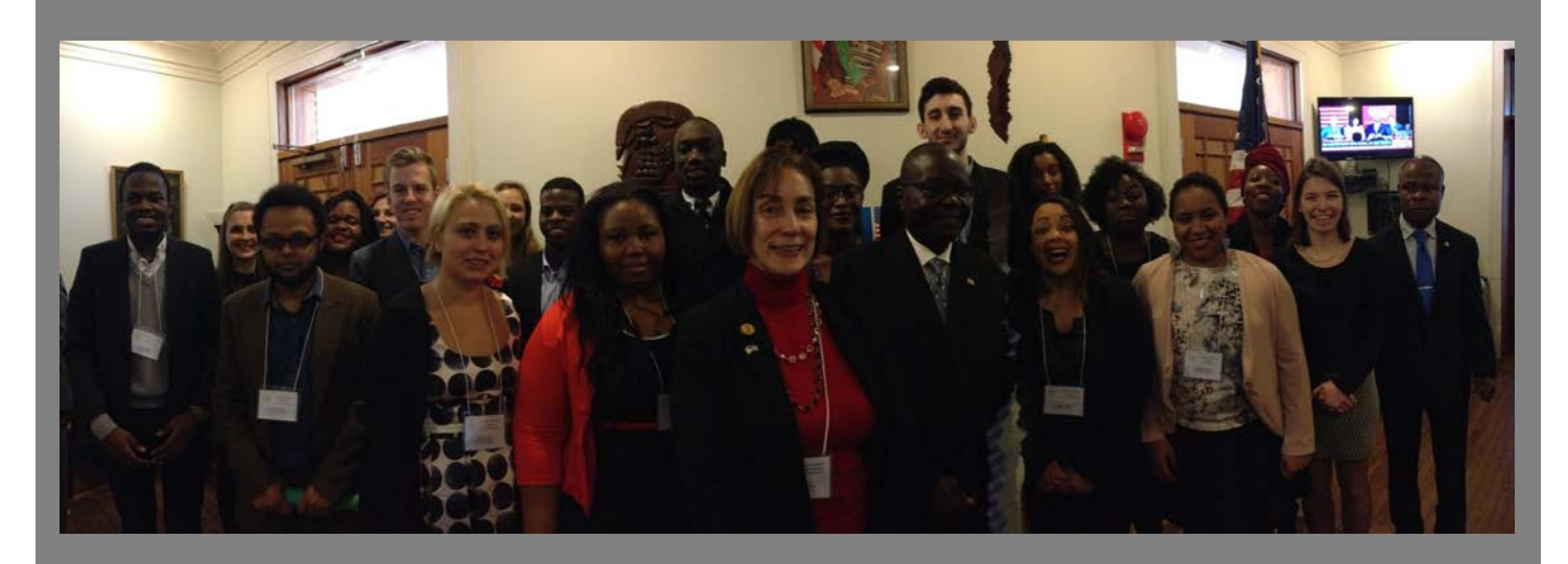
2016 Model African Union Group with the Liberian Ambassador and his staff

Congratulations to the 7 seniors we had at the 2016 National MAU!! Good luck on all of your future adventures!!